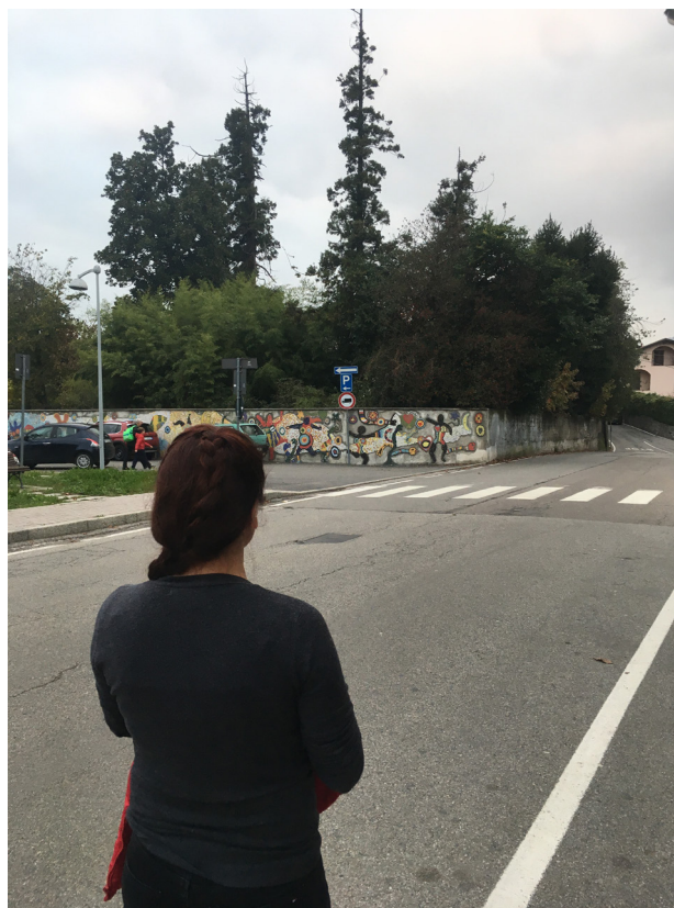
The picture shows the woman described in case 5, who was diagnosed with PTSD and with a high risk of suicide prior to being transferred from Switzerland to Italy. She was not accommodated until 14 days after the Dublin transfer, after which she was accommodated as the only single woman at a CAS centre with about 40 men.

Upon arrival at the all-female CAS centre her mental health had deteriorated due to the conditions at the all-male CAS centre. However, due to the fact that she was transferred to a different centre, she had to wait two months before she could get a new appointment with a psychologist, which only happened after the DRMP's interviewer intervened in the case. In order to continue her treatment, she had to pay to have her medical files from Switzerland translated to Italian, and she still had to ask an acquaintance to provide translation for the sessions with the psychologist.