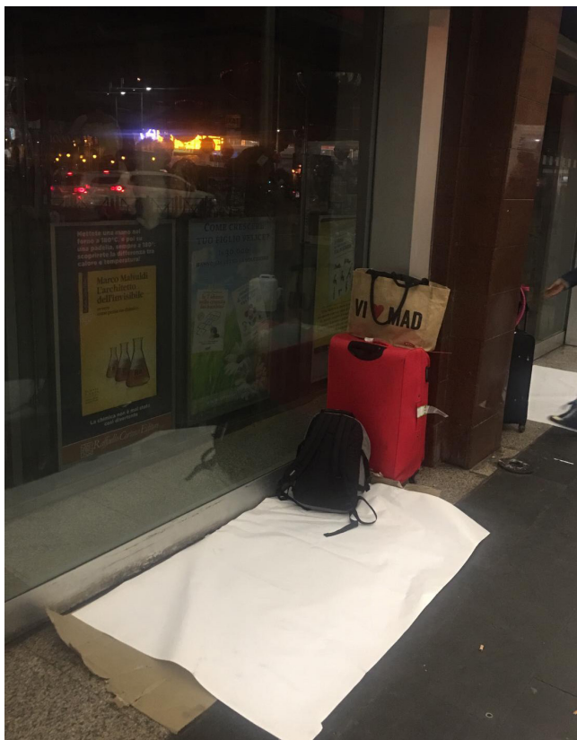
The Danish police had warned the woman described in case 2 that she might have to sleep on the streets in Italy after the Dublin transfer. She had therefore brought a blanket with her from Denmark, which she used to stay warm when she had to sleep outside Termini train station in Rome. The picture was taken by the woman and sent to the DRC.

Approximately one month after the transfer to Italy she was referred to a doctor. The CAS centre also organized an appointment for her at an Anti-Violence Centre where she met with a psychologist. However, after only a few therapy sessions she was informed that she could not continue with the therapy.