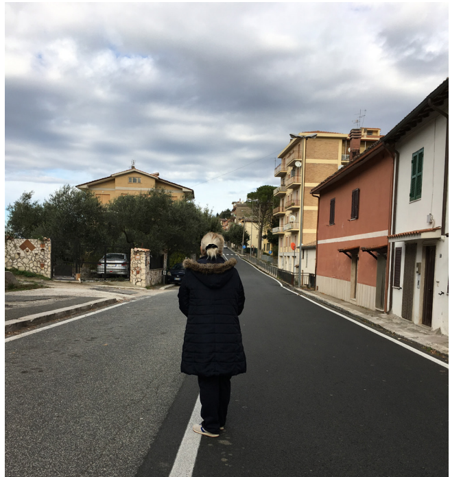
The picture shows the woman described in case 8, who suffers from complex trauma and whose mental health deteriorated following the Dublin transfer, after which she was accommodated at a large CAS centre.

She found the second CAS centre to be very dirty and more isolated than the first centre. Upon arrival she had an allergic reaction, apparently because of the unhygienic conditions, as she shares a bathroom with 15 people, which is constantly dirty. Shortly after arrival she suffered a mental break down as she could not cope with the new surroundings. As a result, she was offered a key to a private bathroom, which she could use until the bath stopped working in November 2018. Following her break down, she was also offered a