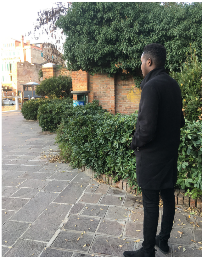
The picture shows the man described in case 10. After applying for asylum in Austria he was found to be 18-years-old and transferred to Italy, where he had been a victim of human trafficking while he was still a minor. After the Dublin transfer he was not provided with accommodation for almost four months during which he was able to stay at a shelter for homeless drug addicts only because the DRMP's interviewer intervened in his case.

He only received legal assistance from the DRMP's interviewer as the SPRAR centre only offered basic information on the asylum procedure.